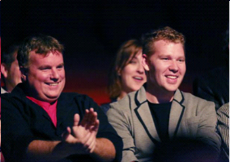
Members of the audience react as stand-up comedian Kevin Pollak performs at the Keith Albee Performing Arts Center in Huntington on Monday, October 28, 2013, in Huntington.